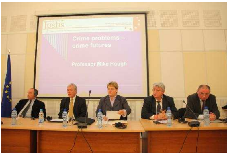
The public discussion event during the conference at the National Institute of Justice (NIJ) the Center for the Study of Democracy.