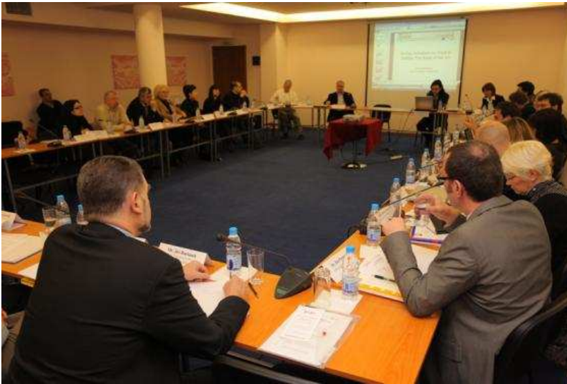
First day of the conference. JUSTIS includes institutions from the UK, France, Lithuania, Hungary, Finland and Italy. The conference was attended by all partner institutions, as well as members of the JUSTIS External Expert Group and other prominent criminologists.